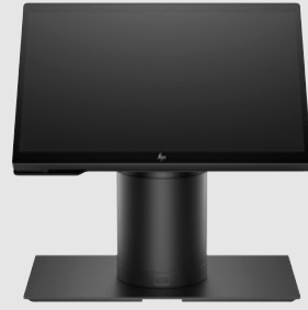
HP Engage Go 13.5 inch Convertible System

Built to deliver across today's demanding business landscape, the HP Engage Go 10 inch and 13.5 inch easily transition from fixed operations to a mobile tablet. They are durable, sized for easy readability, and can integrate essential accessories to seamlessly conduct business where and how it is needed.