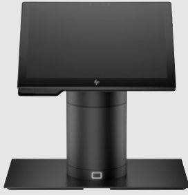
HP Engage Go 10 inch Convertible System

Adapt the sales flow to meet customer needs and deliver an exceptional experience.