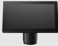
HP Engage One All-in-One System

Customize the HP Engage One Pro to suit your specific needs with its sleek yet durable design combined with powerhouse computing, and multiple deployment options.